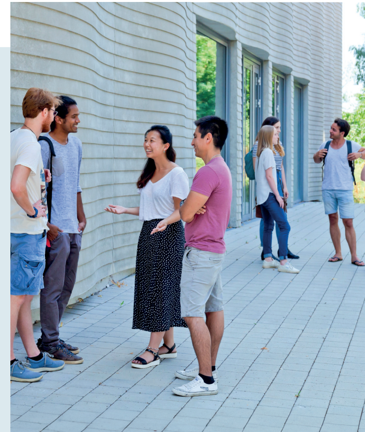
FACULTY OF NATURAL SCIENCES